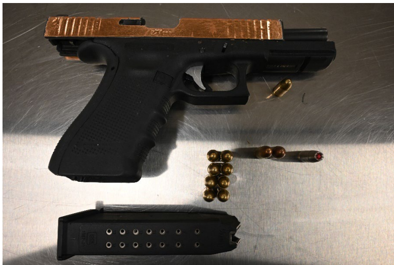
Photograph of 9mm Glock 17 handgun collected at the scene near where Osborn laid. Reflection of light against the gold-colored slide wrap is likely what caused the flash effect seen in the BWC screenshot depicted on page 5

There was a substantial amount of blood on the north side of apartment #49 identifying the location where Osborn was laying when he received medical care before transport. Osborn's gun was recovered a few feet to the east of the blood. The gun was a 9mm Glock 17 pistol, with a unique appearance attributable to a gold-colored slide wrap. The handgun was determined to have a round loaded in the chamber, and eleven additional rounds in the magazine which had a total capacity for seventeen rounds.