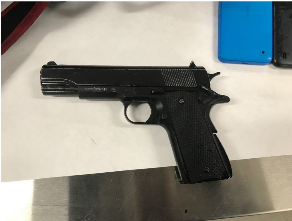
Photograph of BB gun located inside the black backpack which also contained Osborn's identification