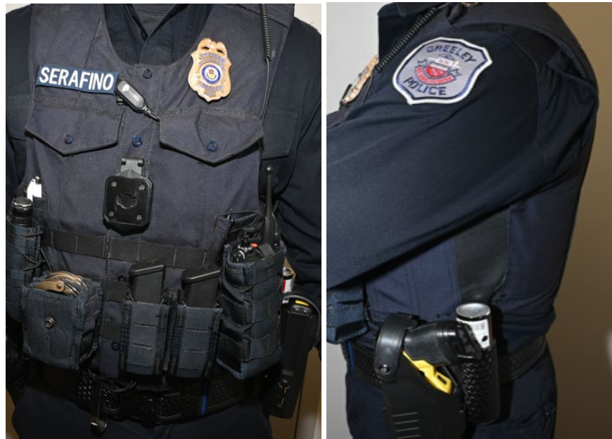
Photographs of Officer Serafino post shooting, showing exterior vest cover, gold badge, police equipment, gun belt & shoulder patches

Officer Serafino was wearing a police uniform at the time of this incident, including the following: long-sleeved, navy-blue uniform shirt with Greeley Police Department shoulder patches, exterior bullet proof vest carrier bearing a patch with his last name and a gold GPD badge, as well as additional police equipment such as handcuffs, radio, and flashlight. Officer Serafino also wore a black basketweave duty gun belt which held a taser and his department issued handgun, a 9mm Glock 17.