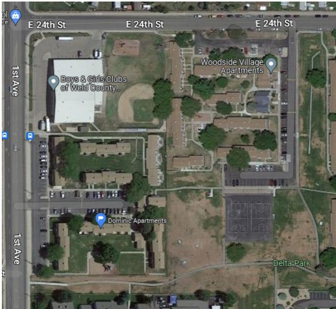
Google earth image showing the intersection of 1 st Ave & E 24 th St – Dominic Apartments & Woodside Village Apartments

This incident began at the Dominic Apartments located in the 2400 block of 1 st Avenue and concluded at the Woodside Village Apartments located in the 100 block of E 24 th Street. Both locations are within the city of Greeley, County of Weld, State of Colorado.