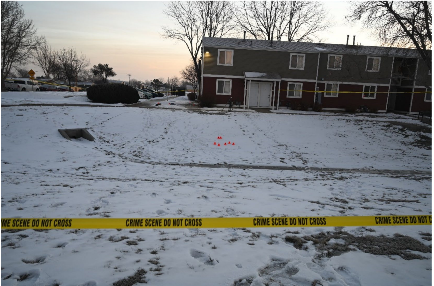
Crime scene photograph taken facing east parallel and just south of 1 st Avenue – seven orange evidence markers just east of the concrete bottom of the drainage ditch mark the location of the recovered shell casings from Officer Serafino's fired rounds

Shell casings were recovered on the upper slope (east side) of the drainage ditch. Though seven evidence markers were placed, only six shell casings were recovered from the scene. Based on round counts and body worn camera footage, seven rounds were fired by Officer Serafino. Shell casings are typically ejected back and to the right of where the gun is fired. Measurements revealed that the distance between Officer Serafino and Osborn at the time the officer fired was less than thirty-eight feet.