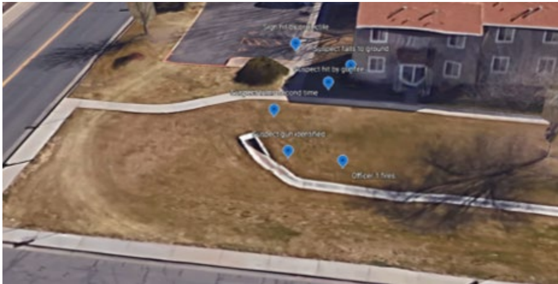
Drone photograph showing 1 st Avenue (road with yellow lines on left) – concrete bottomed drainage ditch – northwest corner of apartment building where Osborn was shot