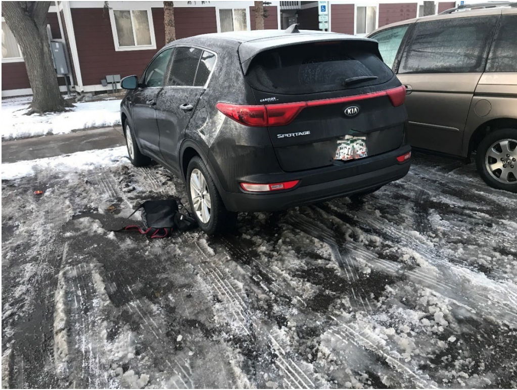
Photograph of black backpack where it was recovered just north of building #130 of the Woodside Village Apartments (the Kia is unrelated, & the license plate has been sanitized from the photograph)