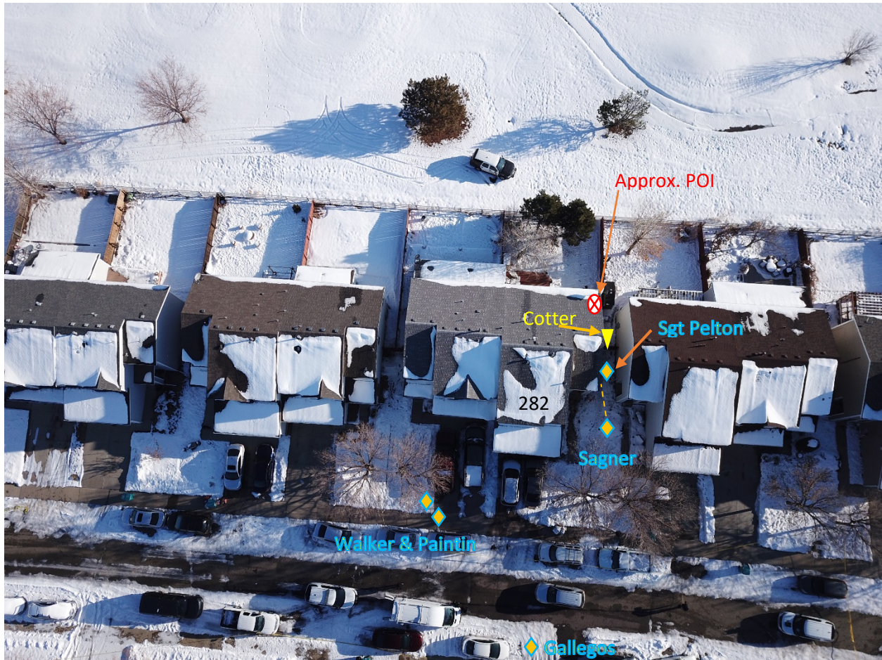
Aerial view of 282 Ponderosa Pl and approximate officer positions.