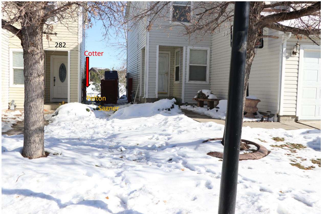
Daytime view from sidewalk with gates open