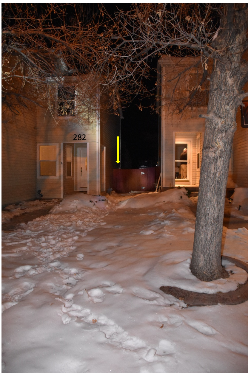
View of gate at night with minimal lighting from law enforcement.