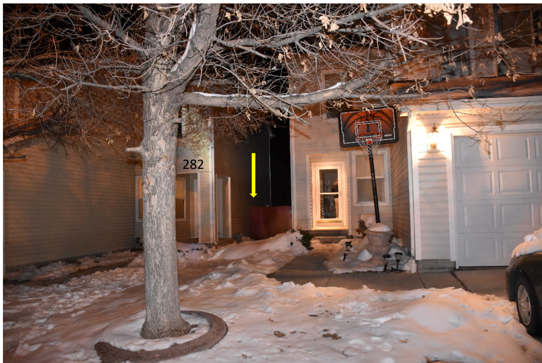
View of gate at night with minimal lighting from law enforcement.