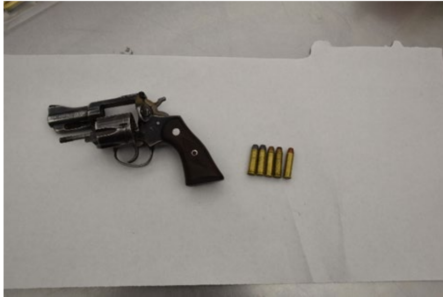
(Crime Scene photo. Moreno Moreno's .357 Ruger Security revolver with 5 rounds unloaded with varying ammunition brands)