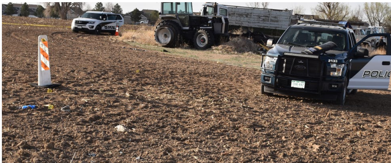
(To the left is Deputy Rexroad's patrol vehicle. To the right is the Evans patrol vehicle's location after contacting Moreno to render medical aid and secure the handgun)