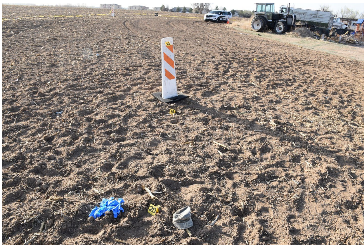
(Deputy Rexroad's patrol vehicle's proximity to Marker #19, the final rest of Moreno's body, approximately 118 Ft.)