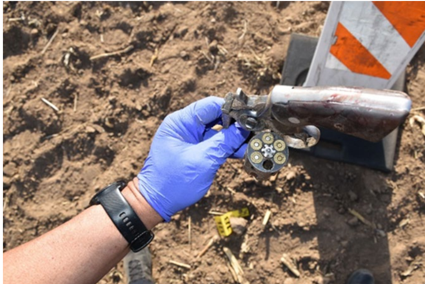
(Moreno Moreno's .357 Ruger Security revolver with 5 rounds and the sixth cylinder empty on scene)