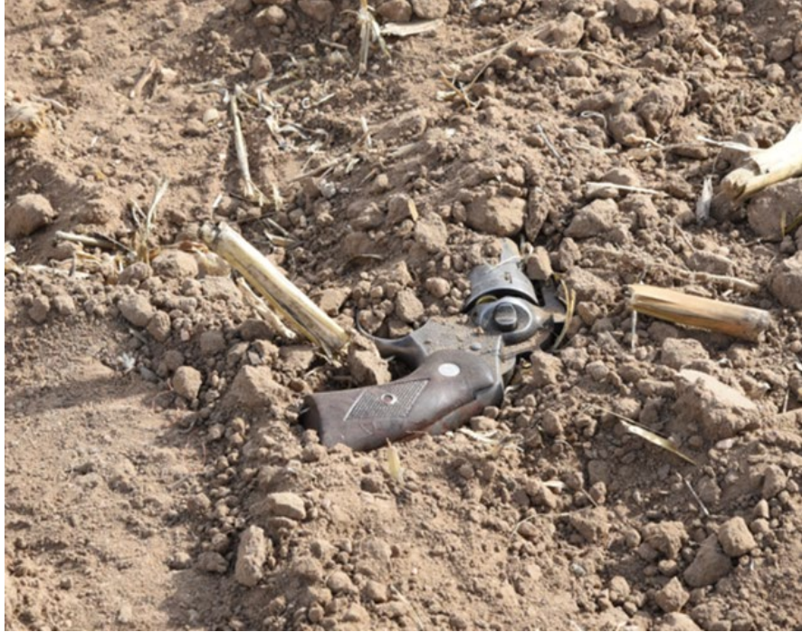
(Moreno Moreno's .357 Ruger Security six round revolver on scene)