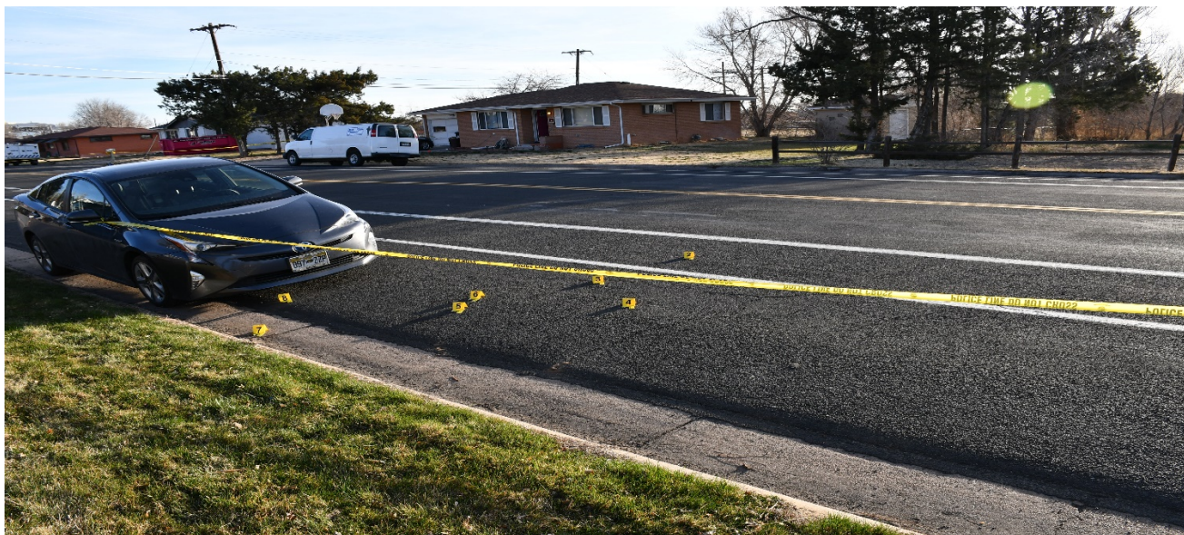
(Parked car where Officer Simental fired. The yellow markers indicate the seven (7) spent shell casings).