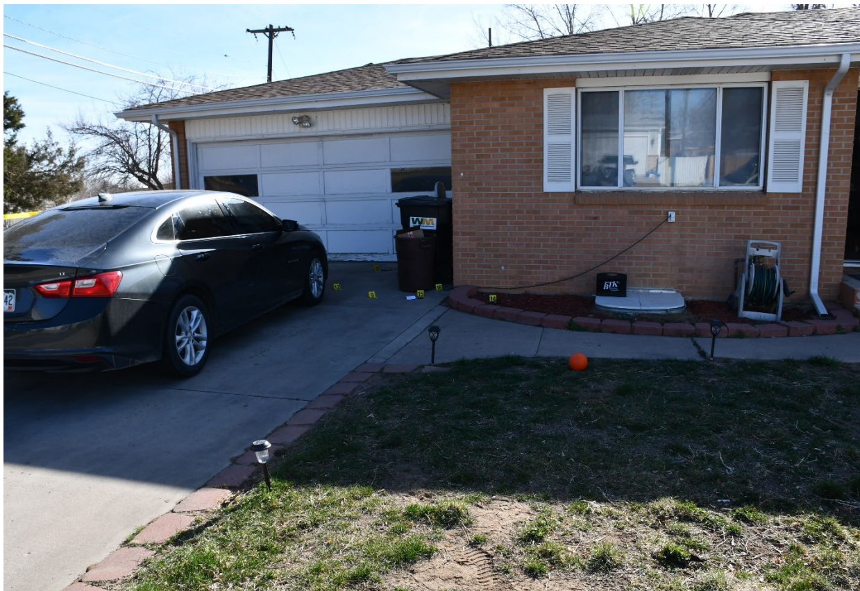
(Photo of the front of 2108 50 th Avenue, where the trash can was located and the area where Devin Goneau was shot).