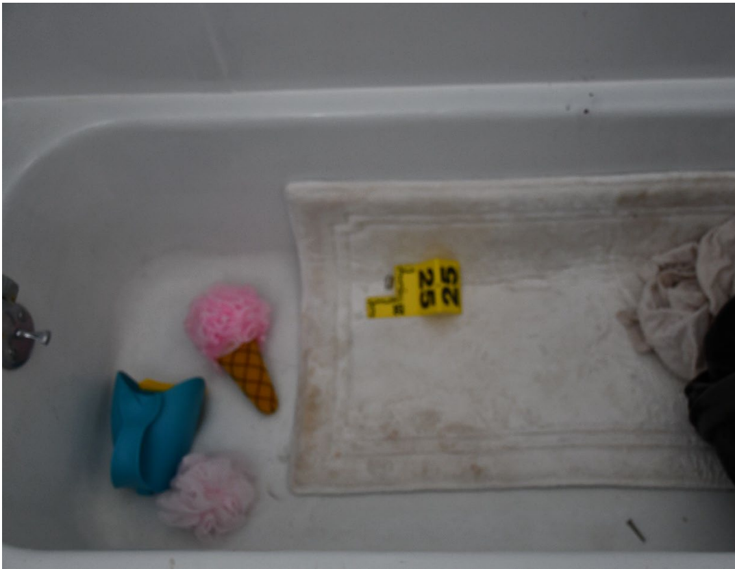
(Crime scene marker #25 marking the location of the spent shell casing found in the bathroom, where Mr. Goneau fired his handgun).