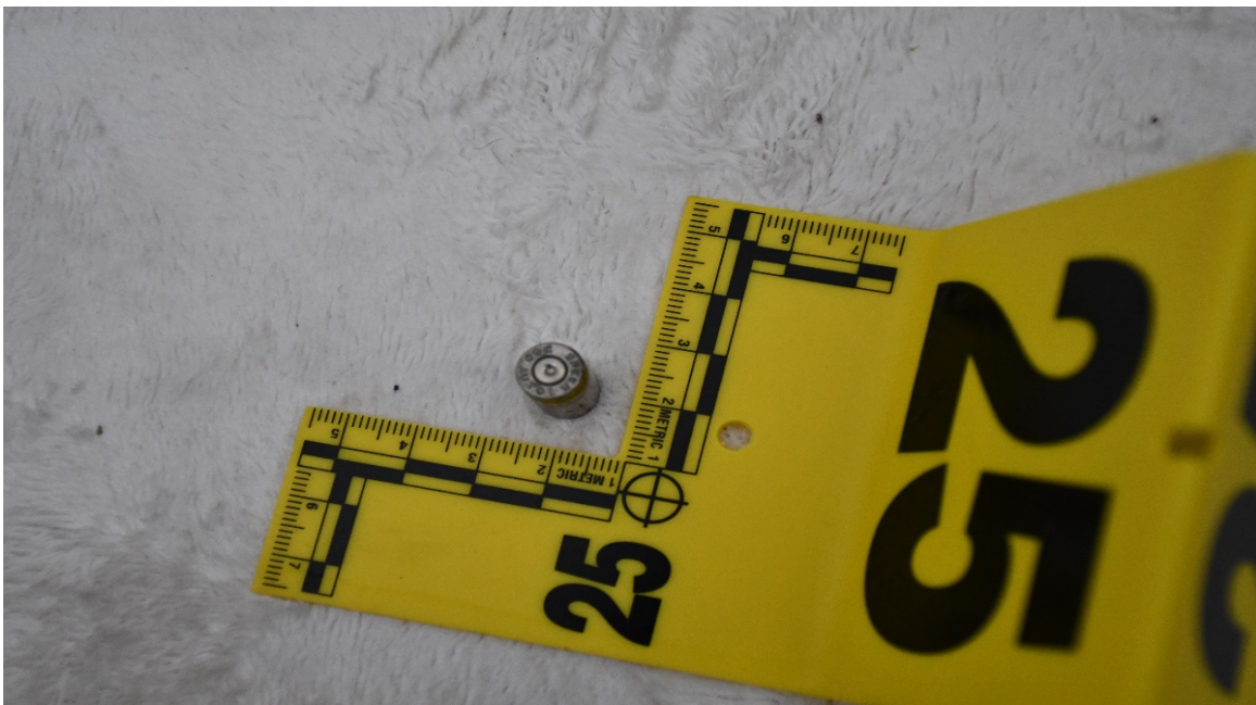
(Close up of the spent shell casing found in the bathroom).