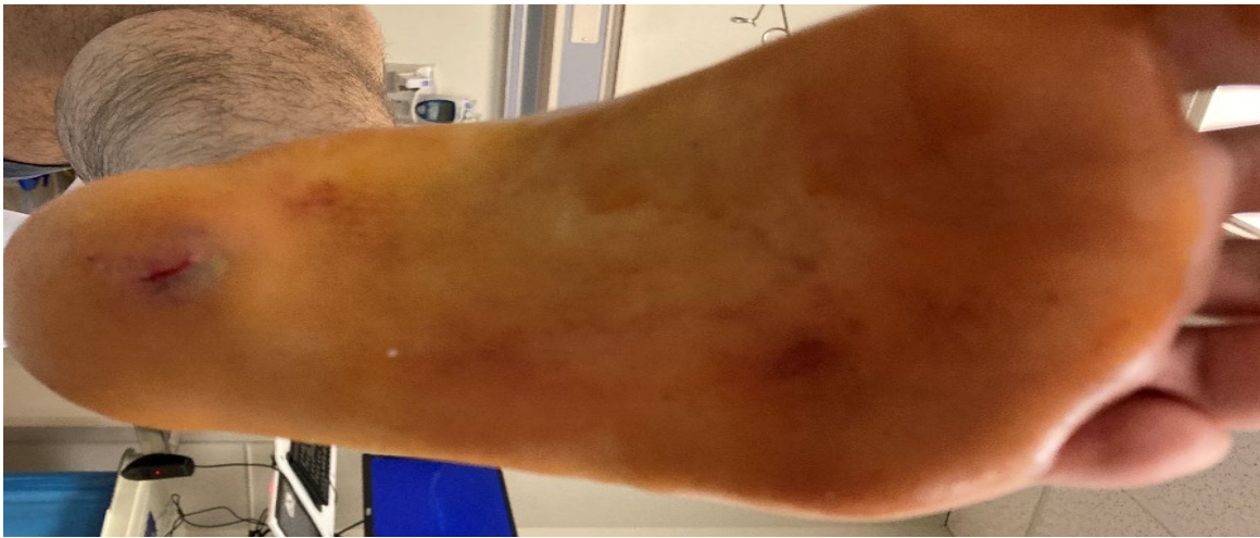
(Photo of bullet that entered Devin Goneau's heel of his left foot).