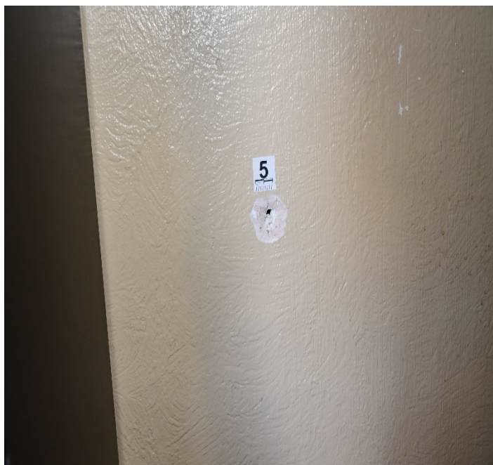
(Marker #4 is the defect in a child's bedroom east wall that is shared with the living room wall. Marker #5 is the defect from the other side of the bedroom wall, into the living room west wall where the bullet was lodged into the drywall).