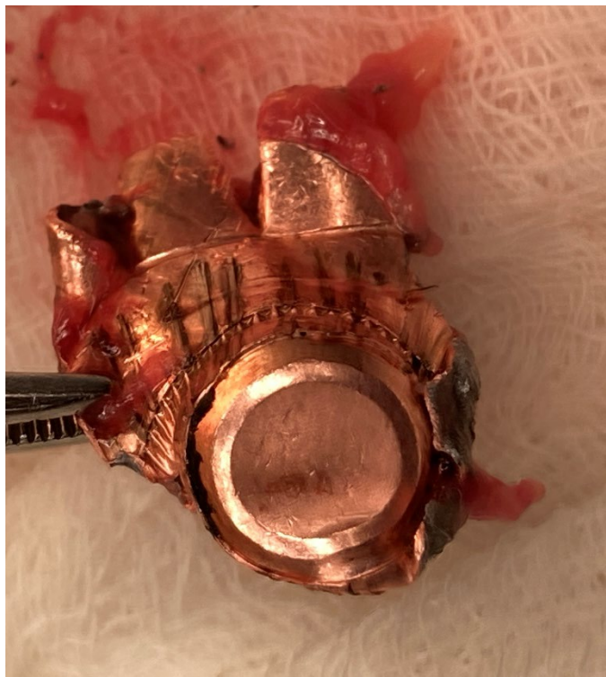
(Bullet removed from Devin Goneau's foot after surgery).