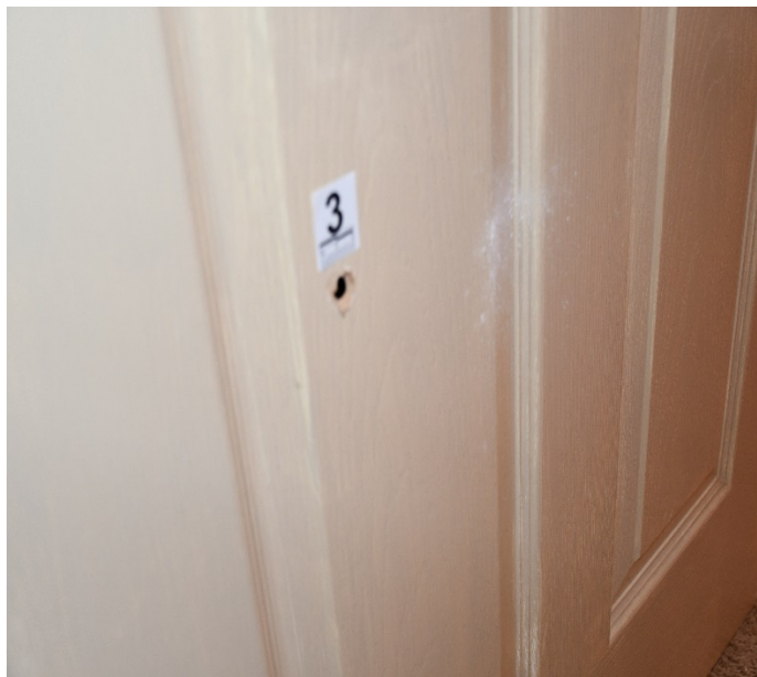
(Marker #2 and #3 is a detached child's bedroom door where the bullet traveled).