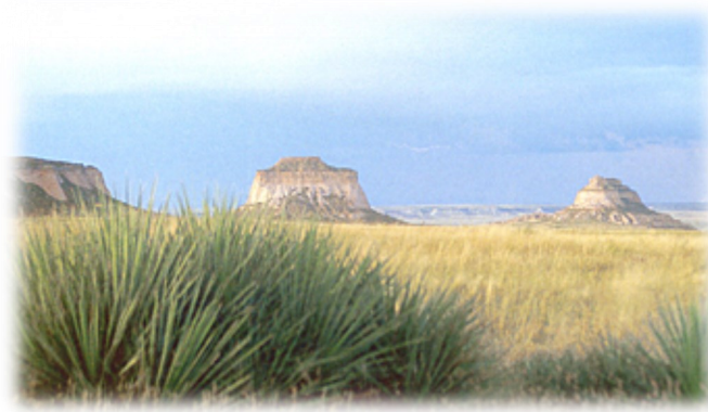
Pawnee National Grasslands, Weld County, Colorado

Our office offers all of the responsibility you want as well as a proactive review process with constructive feedback. We offer continual training for all attorneys and strive to meet our goal of making each attorney in our office first chair homicide capable. When you become a prosecutor in Weld County you have the opportunity to not only see the results of your work on a daily basis but also to become a respected member of a community that cares about public safety and justice.